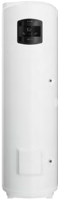
200L Direct/250L Indirect